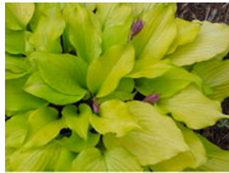
Tickle Me Pink (top)