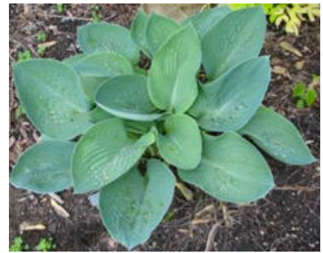
Nate the Great